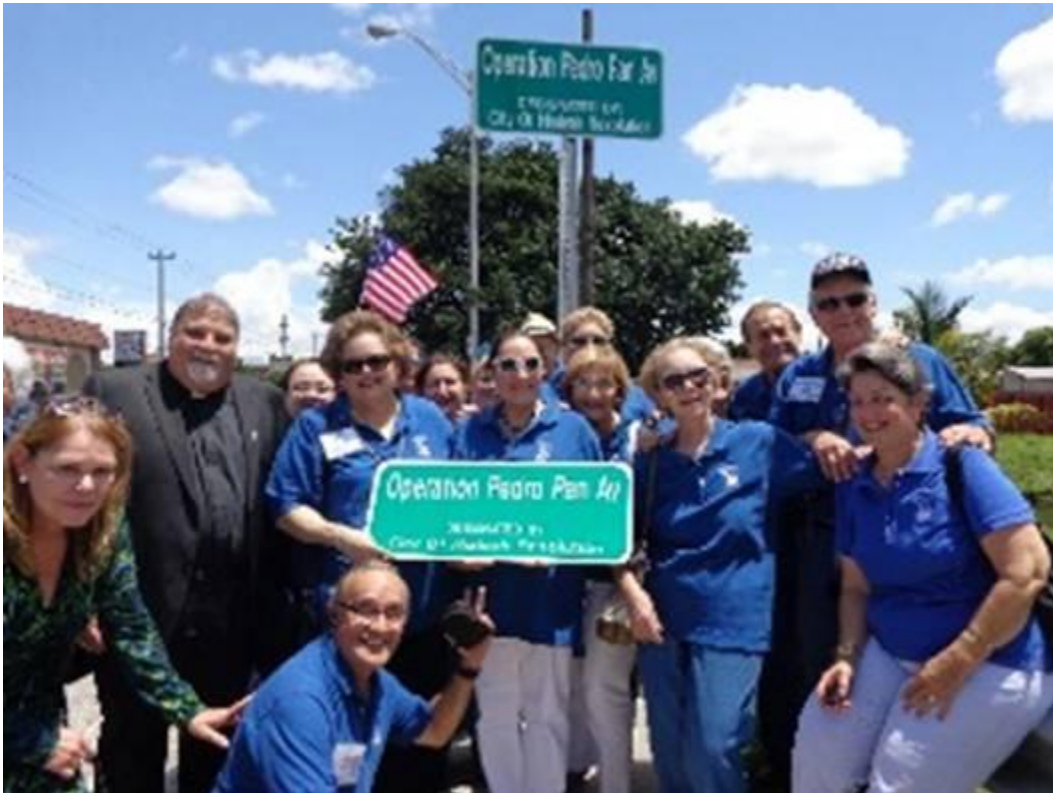
A group of Pedro Pan celebrating the new Operation Pedro Pan Ave. West 12th Ave. 44th St., Hialeah, Fl