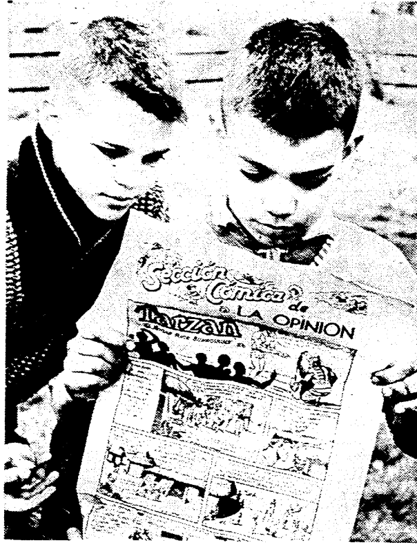
CUBAN COMIC sections tell prowess of Tarzan in Spanish. Yo-yos are equally popular with Cuban youth.