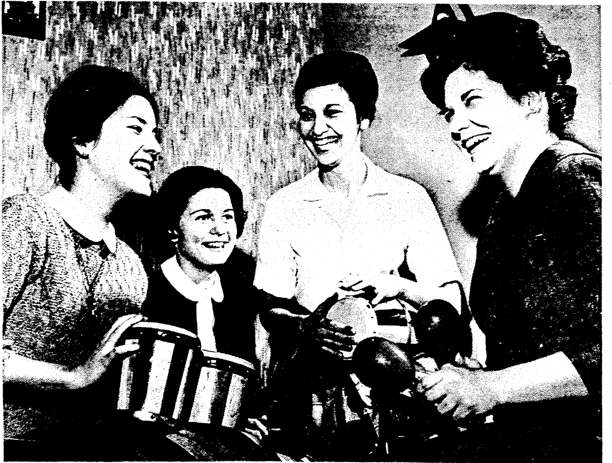
A LATIN BEAT fills home where the happy girls live. Their parents telephone them often for reassurance of their well-